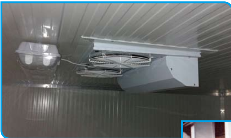
Monoblock Ceiling Type