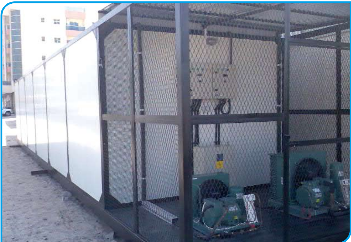
Portable Cold Room