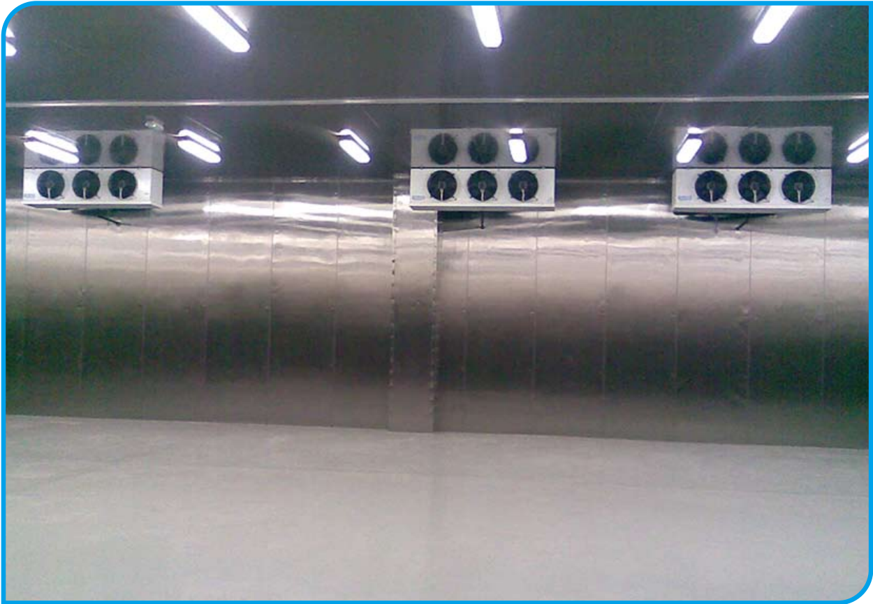
Cold Room with SS Finish