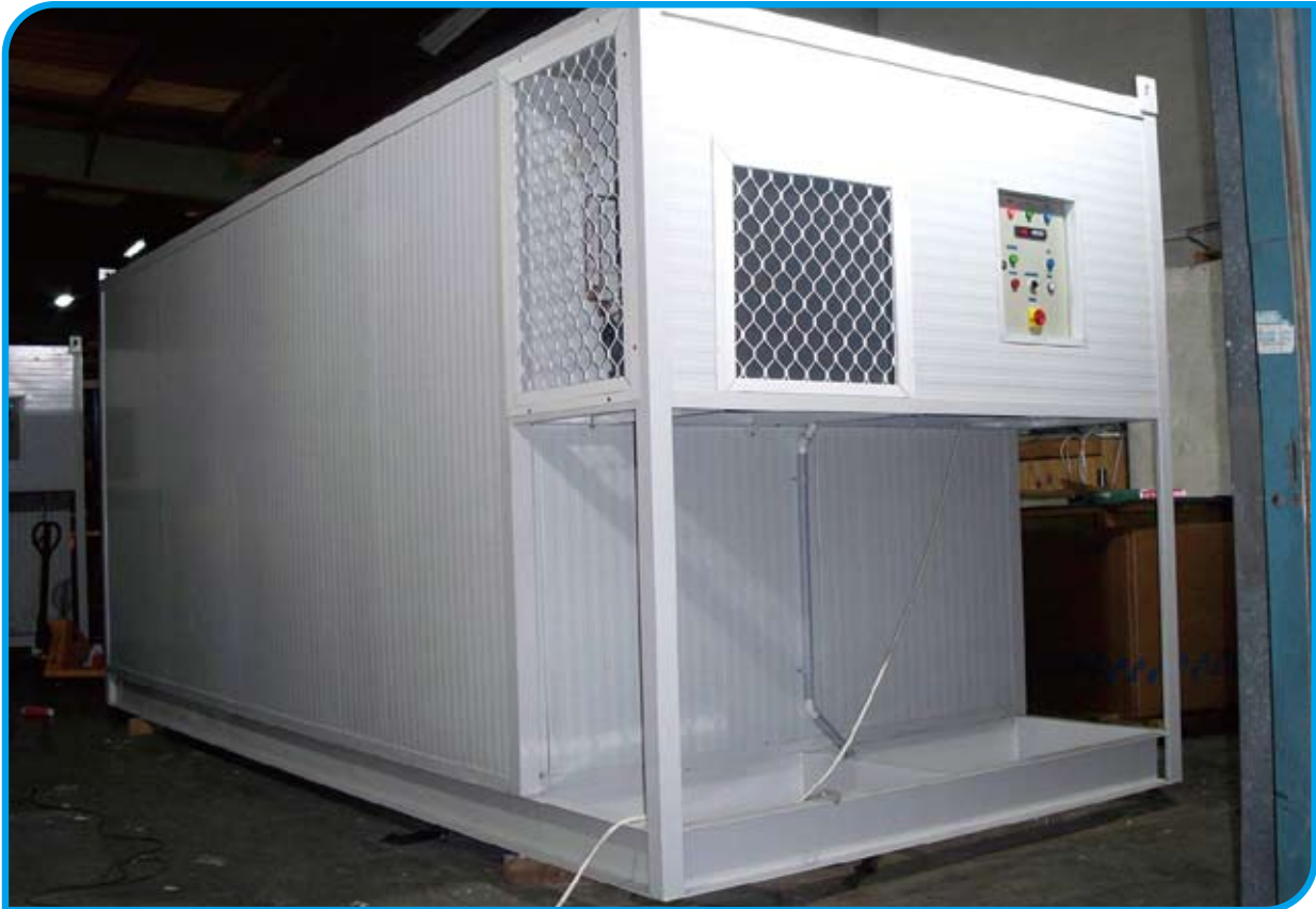
Portable Cold Room