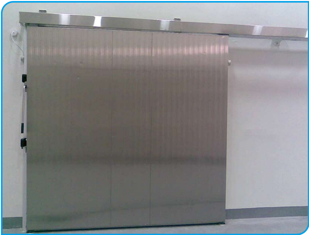
Sliding Door SS Finish