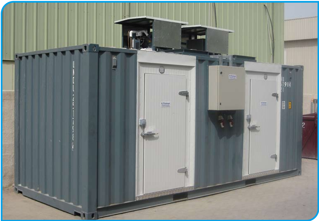
Cold Room Inside Container