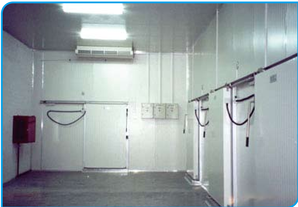
Sliding Doors PP Finish