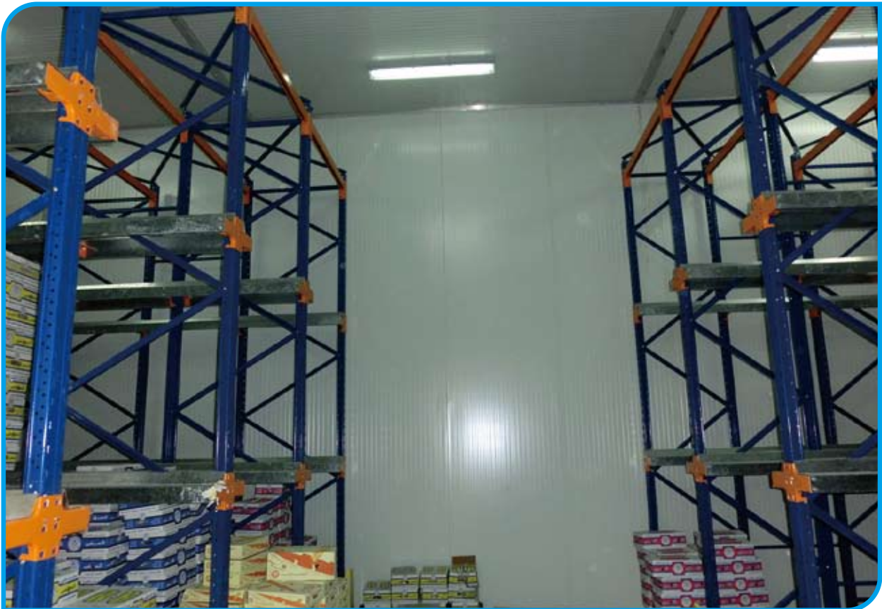
Cold Store with Racking