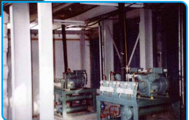
Water Cooled Units