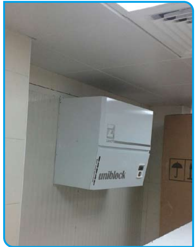
Mono Block Wall Type