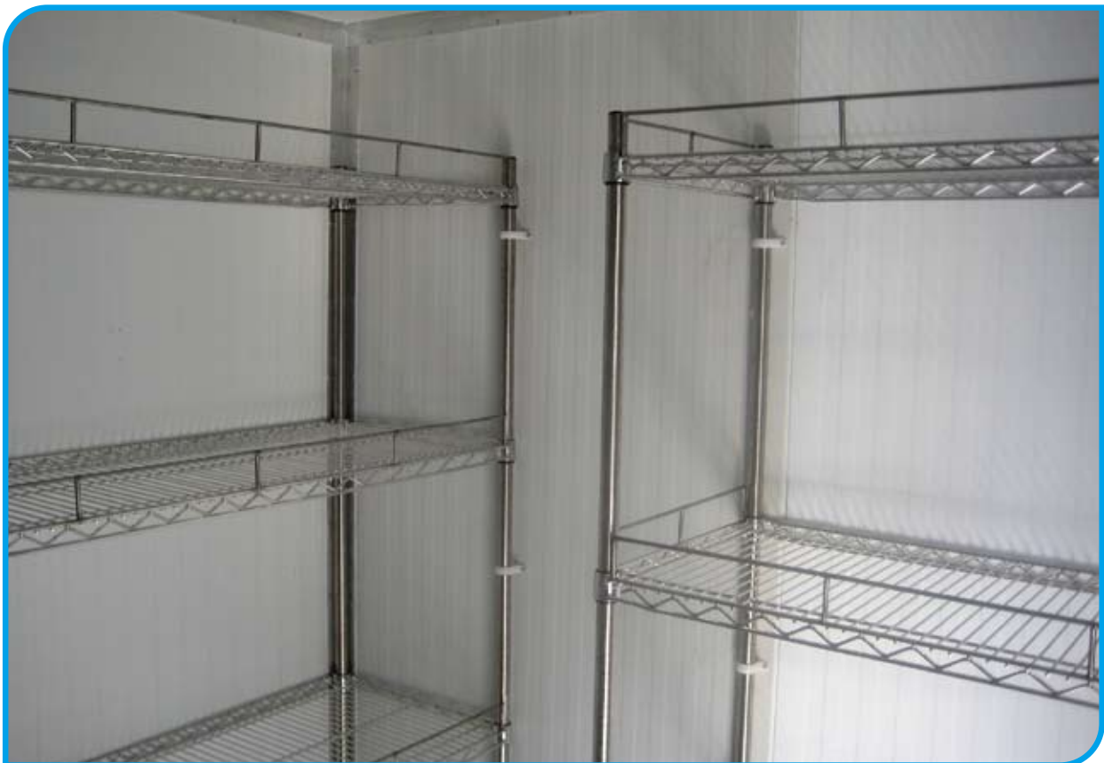
Cold Room with SS Shelving